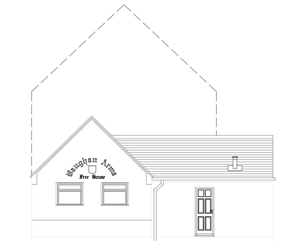
Existing (Car Park) Side Elevation